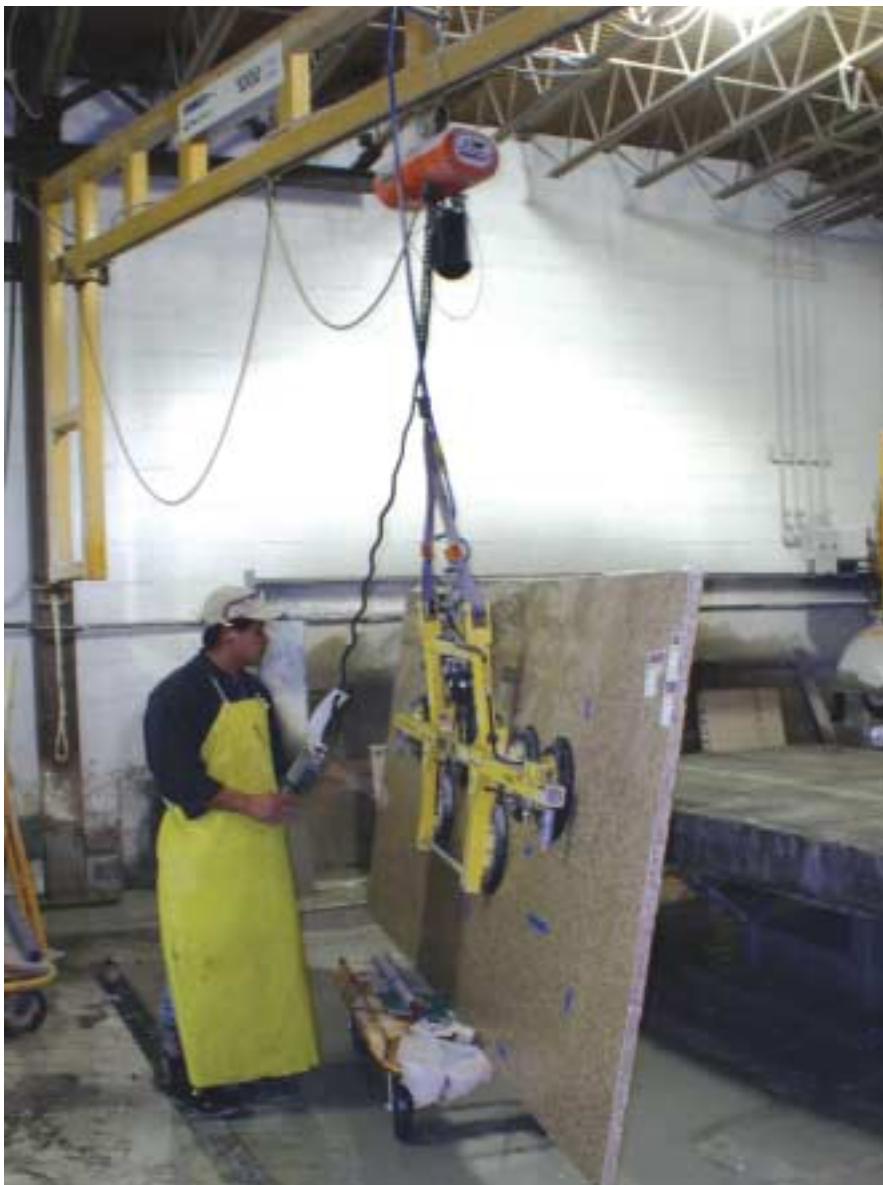
A Wood’s Powr-Grip vacuum lifter is used to move the Silestone slabs around the shop.

In using the Faro digital templaters, the “Faro Arm” is placed at a stationary position at the jobsite, and the arm is maneuvered as needed to collect all of the relevant data for a particular project. It works at an extremely high level of precision, and can record intricate details of a space.