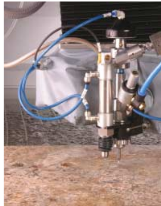
Flow waterjets are used for difficult and complex cuts.

"I'm in the middle of changing the production flow," he said at the time of Stone World's visit. This will involve shifting the placement of machinery and installing a conveyor belt to make the fabrication process run even more smoothly. "I'm making all processes for cutting in one area," explained Murray.