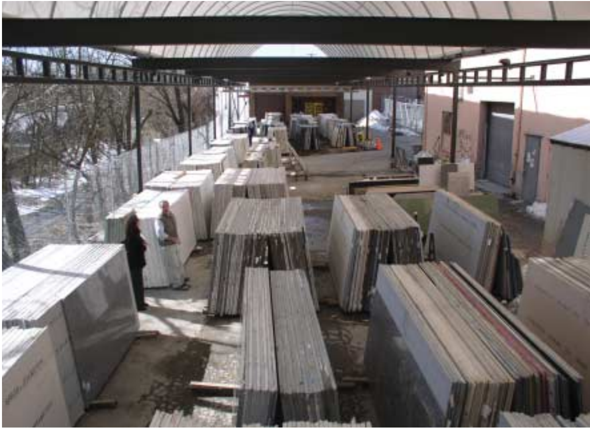
The company receives about 20 containers a month of Silestone slabs.