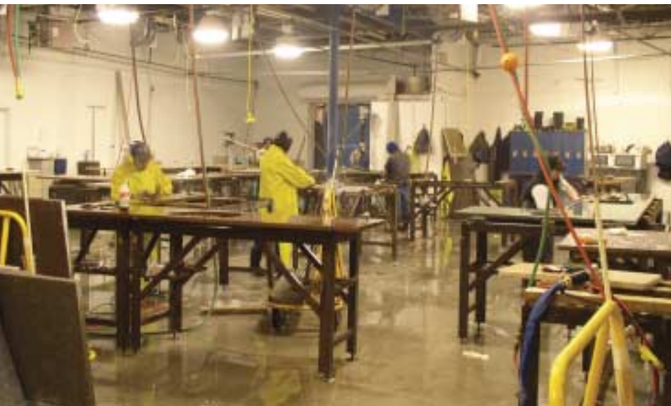
Hand tools from GranQuartz of Tucker, GA, are used for finishing in a specially designated area of the shop.

Color-coding is also a very important feature of JobTracker. The company is able to assign each area such as Washington, DC, and Northern Virginia with a specific color, and make sure that the installation team assigned to the project makes the most sense from a geographical standpoint. "By using colors, we can visually move jobs around," said Murray. "There are also other visual clues." For example, jobs in green have been confirmed with the customer, ones in black have been scheduled but not confirmed, and jobs