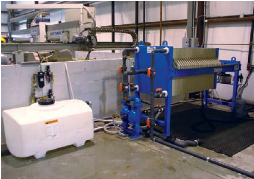
To maximize water efficiency, the shop uses the EnviroSystem water recycling system from Water Treatment Technologies of Hampton, NH.