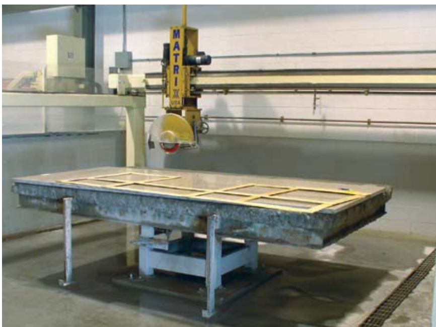
Prior to sawing, Luan plywood templates are laid out on the workpiece.