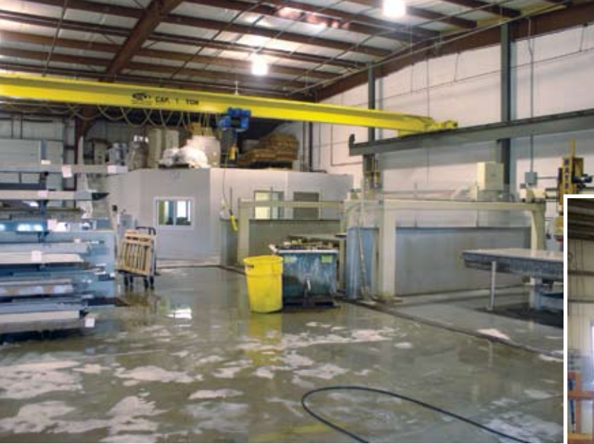
The Millbury shop has separate rooms for sawing and edging/finishing, and material is maneuvered with a 1-ton overhead crane.