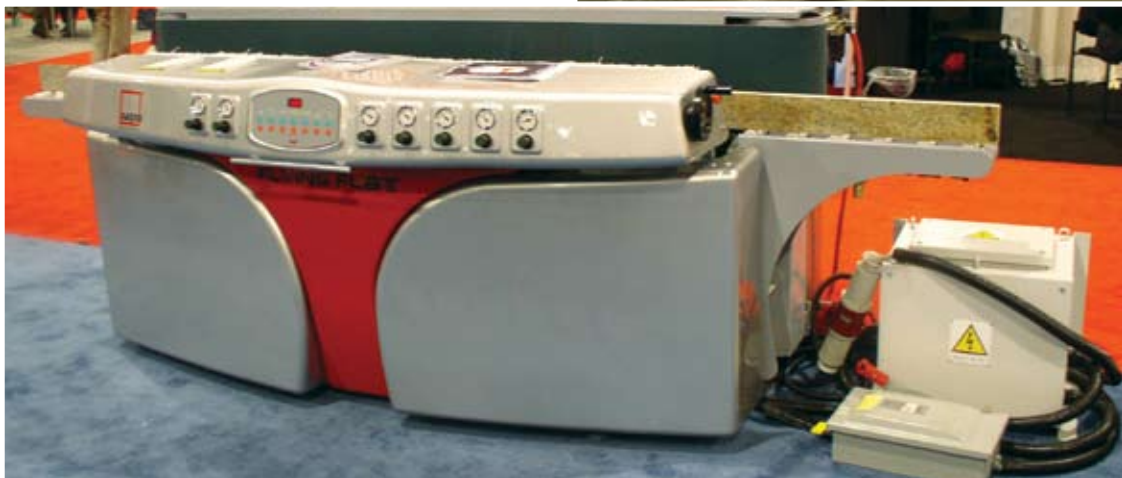
The company is also investing in two Sasso Flying Flat automated edge polishers from U.S. Granite Machinery — one for each location.