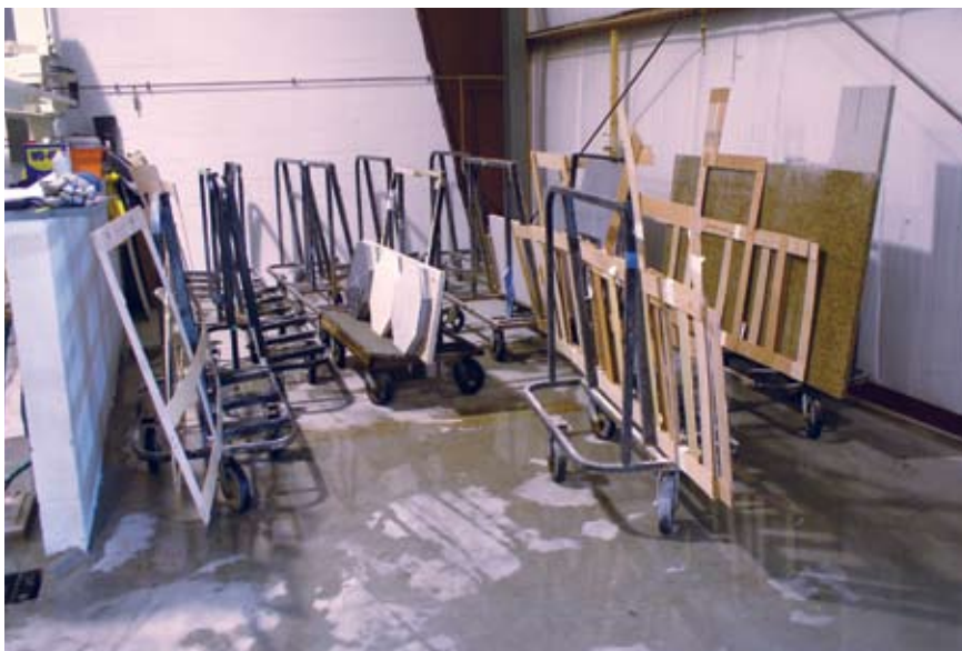
Jobs are also transported and staged using carts from Braxton Bragg, and there are 50 carts in all.

Having two locations offers the company some synergy in its equipment use. For example, with the two CNC machines in place in Millbury, Discover Marble & Granite can now move the Park Wizard to the Ft. Meyers location.