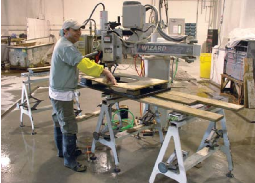
A Park Wizard radial arm polisher is being used for polishing sink cut-outs, and the unit is being moved from the Millbury location to the Ft. Meyers shop.