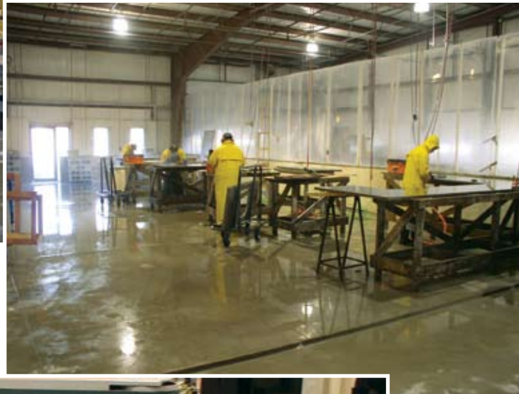
In all, the company has 85 employees -- 62 in Millbury and 23 in Ft. Meyers.