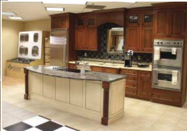
Viking's customer base includes some of the major builders in the Northeast.

support from Park, which offers diagnostics online for minor problems. It also offers next-day shipping of replacement parts.