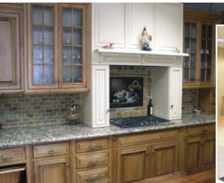
Production currently stands at eight kitchens per week.