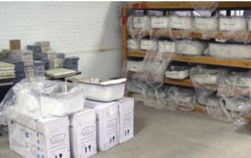
As an added customer service, Viking stocks sinks from Artisan Manufacturing Corp., and all of the sink dimensions are stored on a computer so they can be simply entered into the CNC unit.